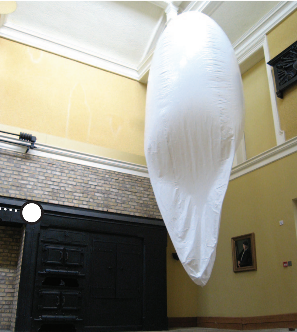
Paul Gregg Amorphous Plastic and helium, 2006