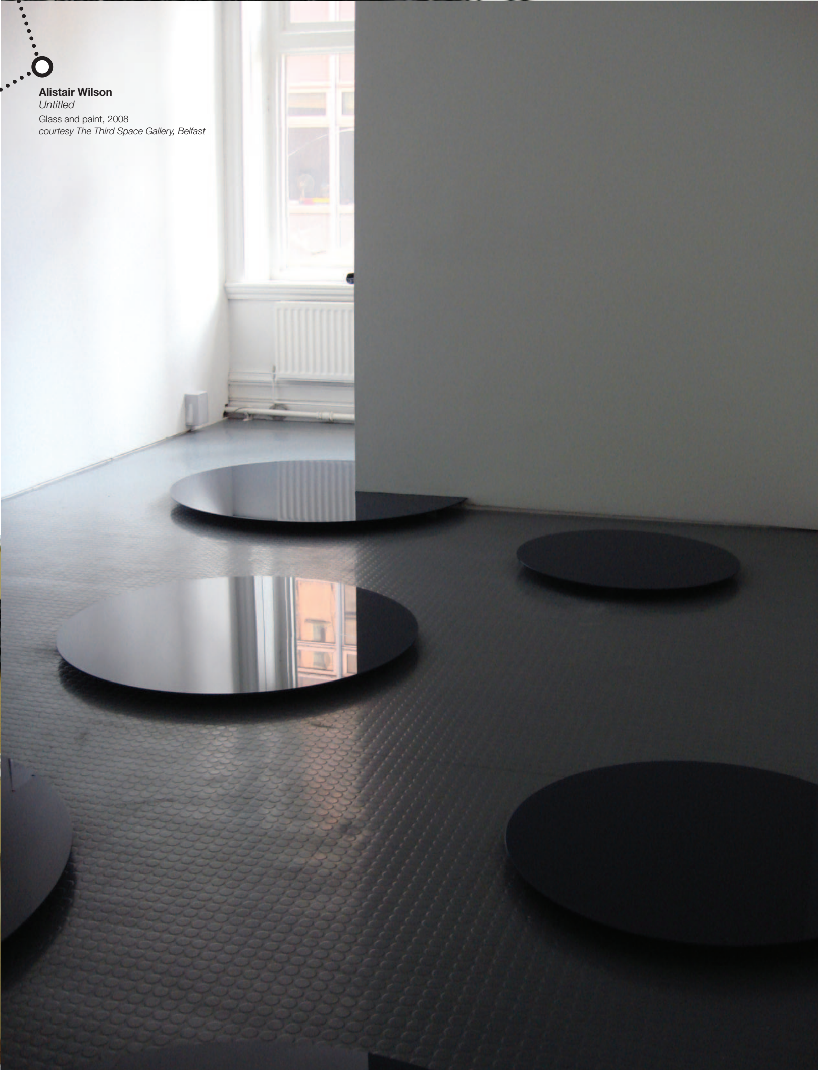
Alistair Wilson Untitled Glass and paint, 2008 courtesy The Third Space Gallery, Belfast