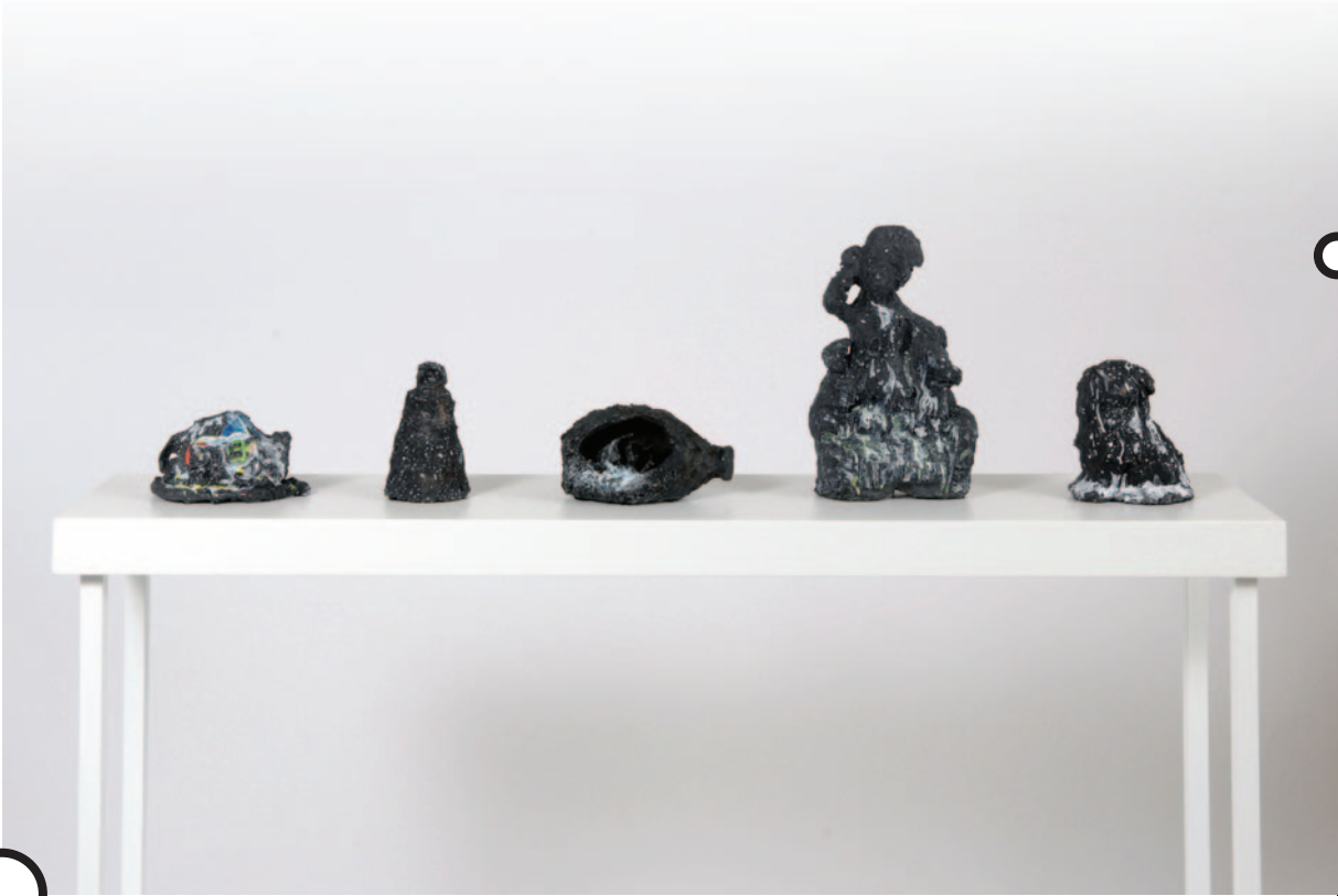
Kathy Prendergast Characters from a Family Tree I 5 sculptures, patinated bronze with paint, 2007 courtesy of Kerlin Gallery, Dublin