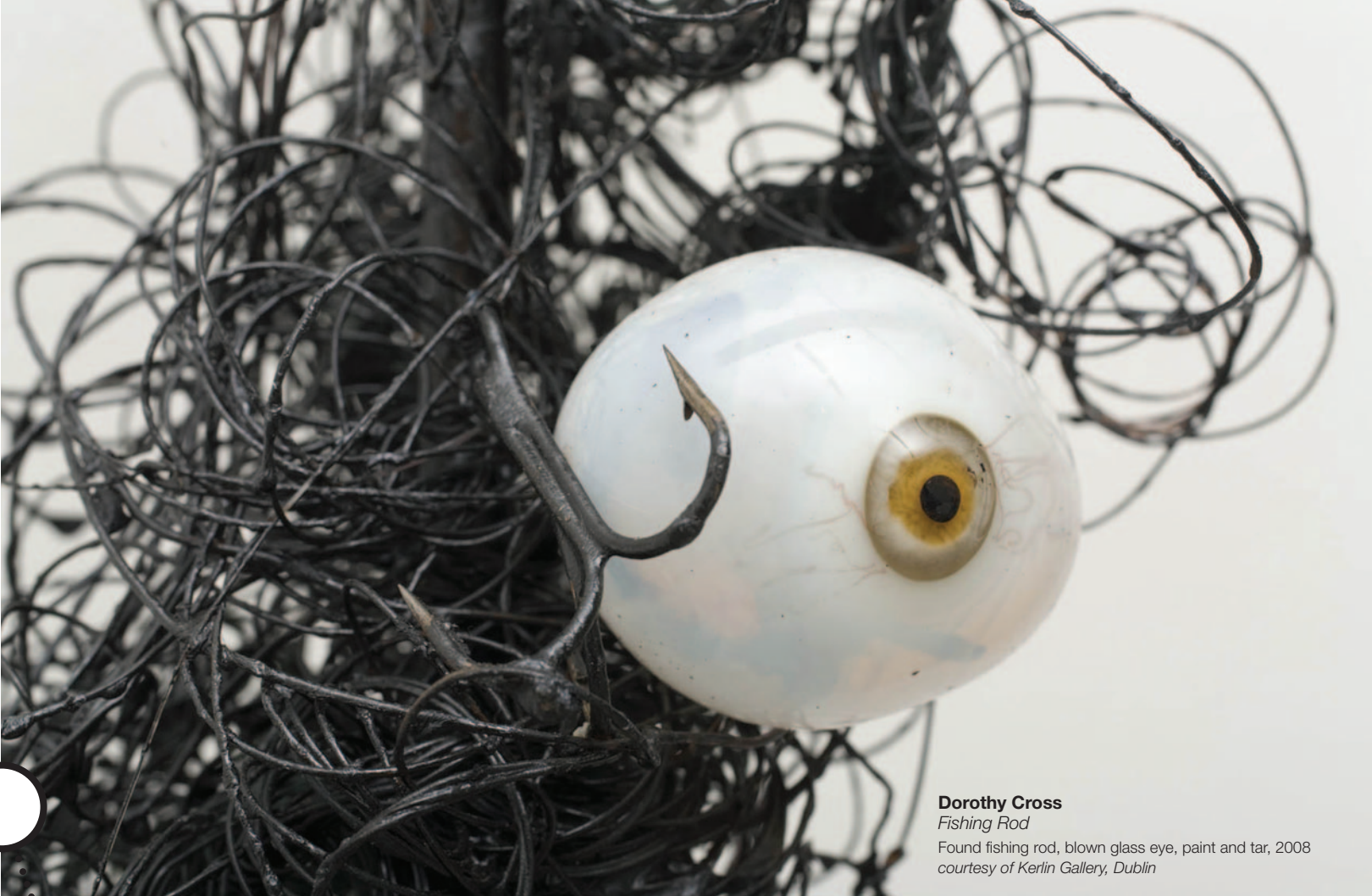
Dorothy Cross Fishing Rod Found fishing rod, blown glass eye, paint and tar, 2008