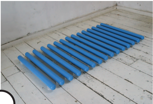
Fergus Martin Pipe Dreams 4 Plastic, carpaint, 15 pipes, 2004 courtesy of Green and Red Gallery, Dublin